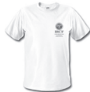
Color IRCF logo labeled CONTRIBUTOR St. Eustatius, Lesser Antilles