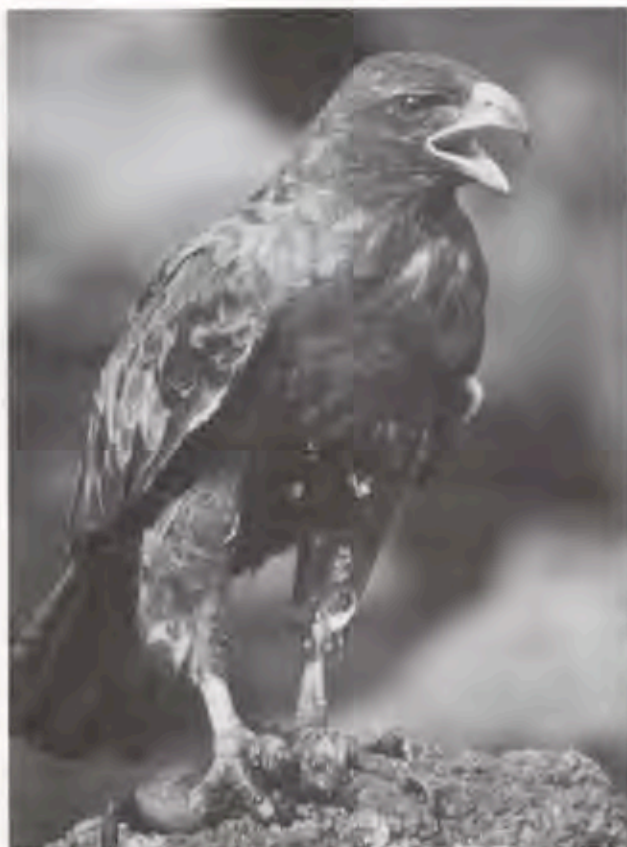
Galápagos Hawk killing a hatchling Marine Iguana on Santa Fe Island.

the oil tanker "Jessica" ran ashore on nearby San Cristobal Island and spilled about 750,000 gallons of diesel and bunker oil. Consequently, oil contamination could pose a serious threat to all populations of Galápagos Marine Iguanas, even those that live far from human settlements and would otherwise be considered pristine. As to the specific mechanism of mortality, we suggest that hindgut endosymbionts are highly susceptible to oil in their digestive substrate. Marine Iguanas need these bacteria to digest algae fully, a process that can take up to two weeks. These specialized and highly effective gut bacteria probably suffered heavily due to the oil spill, which in turn caused failed digestion and widespread starvation among Marine Iguanas.