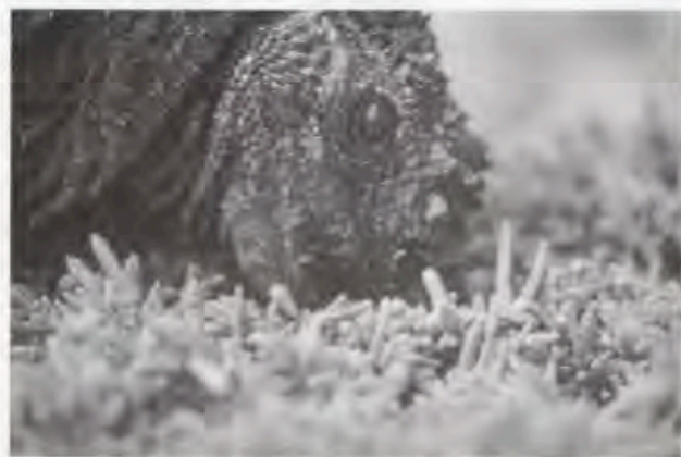
Male Marine Iguana on Seymour Norte Island eating Saltwort ( Batis maritima ) on land. Some individuals supplement their food with land plants.

Carpenter 1966, Trillmich and Trillmich 1986, Wikelski et al. 1993, Wikelski and Hau 1995, Drent et al. 1999). Marine Iguanas possess an internal biological clock that is synchronized to the tides. This clock cues them to walk to the intertidal zone every day at low tide, when the algae are exposed (Wikelski and