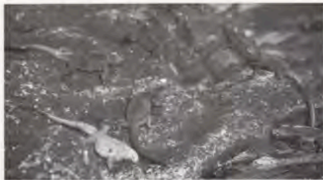
Marine Iguanas in the intertidal zone on Genovesa Island during the low tide, grazing on green algae (mostly Ulva sp.). This population is the smallest in body size and males with body mass as little as 500 g are seen diving.