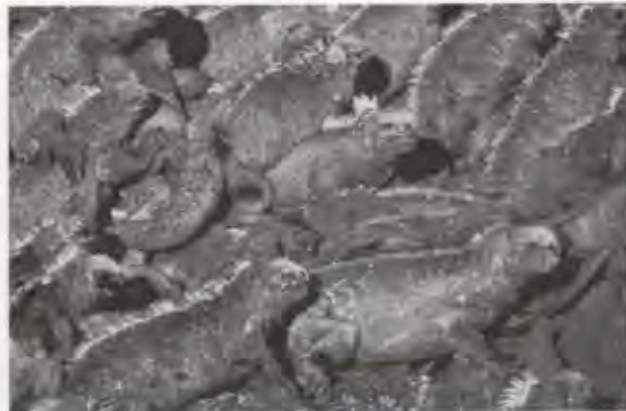
Bachelor male Marine Iguanas from Fernandina Island. Note the elaborate spines that are very prominent in this population of large individuals. On Fernandina, diving males usually exceed 3500 g.

(iv) The fourth and potentially most difficult research activity for the conservation of Marine Iguanas would be to try to breed animals in captivity. Astonishingly, this has never been attempted, and we are unsure whether it is even possible. The challenges for holding and breeding Marine Iguanas in captivity are manifold. First, Marine Iguanas have very specific dietary requirements. Only certain types of seaweed are preferred and eaten — as soon as the natural algae composition changes, we find dramatic mortality rates in the wild. Second, although early naturalists removed several Marine Iguanas from the Galápagos Islands and brought them into zoos, none of those iguanas ever