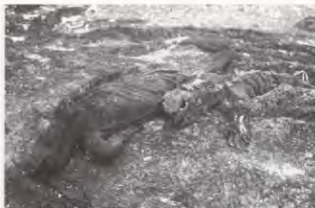
Dead Marine Iguana on Fernandina Island during the 1998-99 El Niño period. The likely cause of death was starvation.