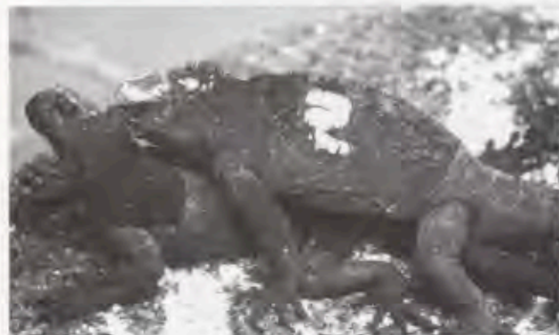
A satellite male Marine Iguana forcefully approaches a female to attempt copulation.

Hau 1995). The largest iguanas of each island population also dive for algae (2–30 m depth; Buttemer and Dawson 1993). On Genovesa, males with body mass >500 g are seen diving, whereas on Fernandina usually only males >3500 g dive for food (Wikelski and Trillmich 1994). A few individuals supplement their food with land plants, in particular on Seymour Norte Island. Only highly salty land plants are ingested (primarily Saltwort, Batis maritima , but also other coastal succulents such as Sesuvium portulacastrum ), presumably because Marine Iguanas possess very specialized hindgut micro-symbionts that