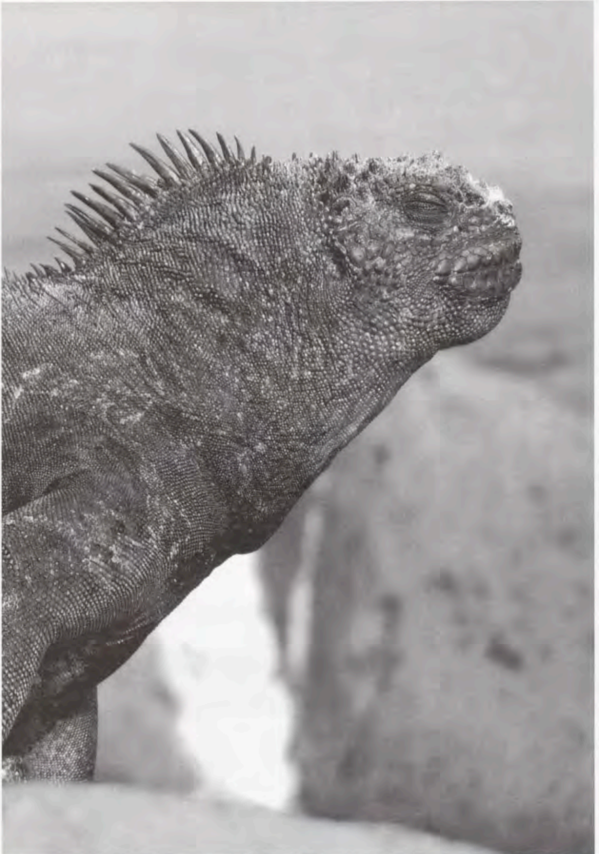
Adult Marine Iguana ( Amblyrhynchus cristatus ) from San Cristobal Island in the Galápagos Archipelago.