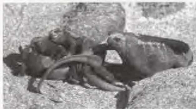
Two sneaker male Marine Iguanas on Genovesa Island attempt to forcefully copulate with a female outside of a territory (on sand). The territorial male (right) left his territory and interrupted the copulation attempt.