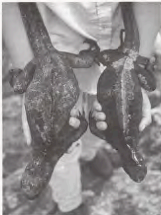
Comparing two Marine Iguanas on Santa Fe Island showing how much individual iguanas can shrink. The iguana on the left could shrink in body length to the size of the individual on the right during an El Niño.

viduals that suffered low levels of environmental contamination. Hindgut microbes probably die during anthropogenic disasters such as oil spills, and Marine Iguanas subsequently starve. Such a situation is comparable to what happens to other vertebrates when endogenous gut symbionts are eliminated, for example, by chemical contamination or antibiotic medication. In such situations, the gut fauna can be re inoculated using pills containing spores of endogenous gut symbionts. The horizontal transfer of gut symbionts from unaffected to affected individuals also is possible in Marine Iguanas. Thus, once we have established how many and what kind of hindgut endosymbionts Marine Iguanas possess, and how such symbionts work, researchers presumably could collect gut material from healthy individuals and treat suffering individuals.