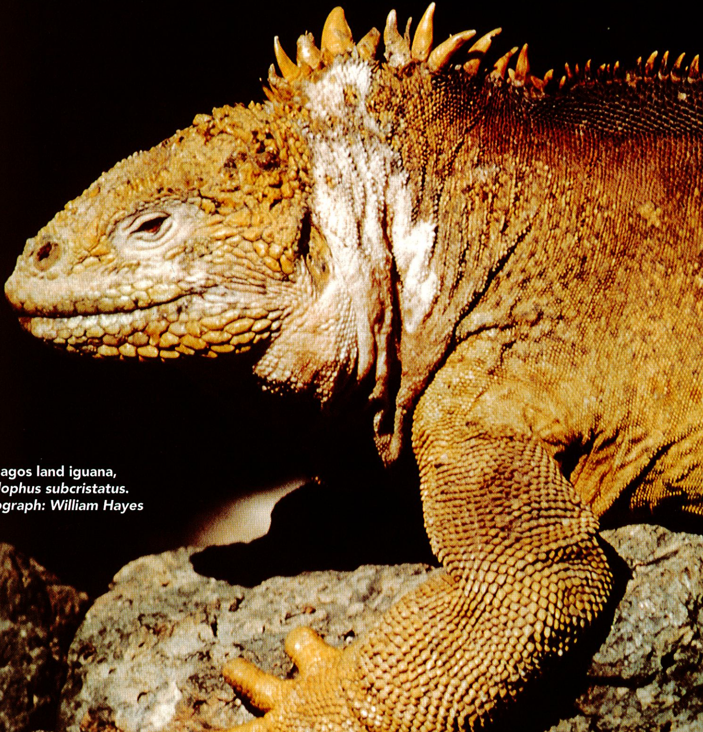
Galapagos land iguana, Conolophus subcristatus .