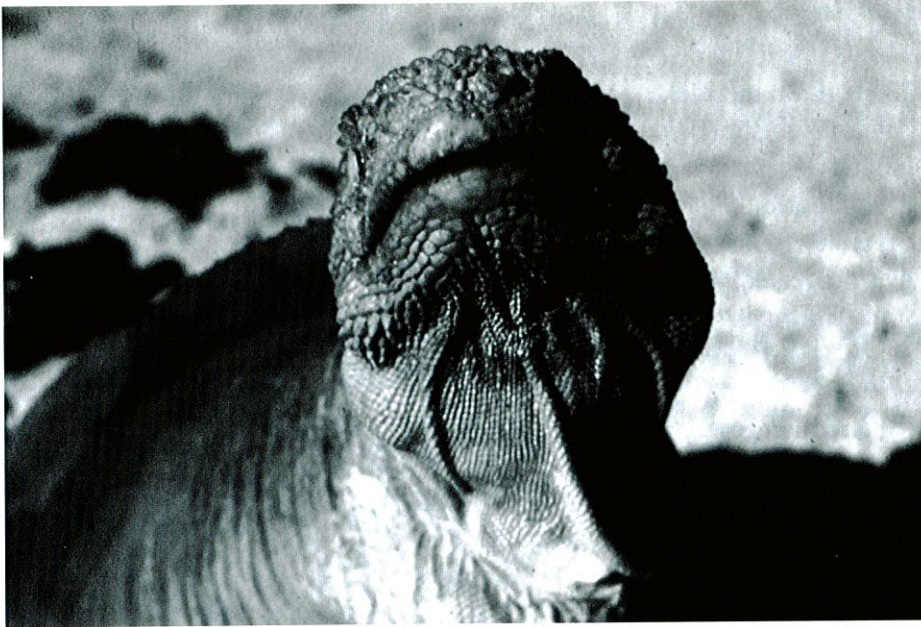
Galapagos land iguana, Conolophus subcristatus , charging the author on Fernandina Island. Photo taken just before the lizard crashed into the camera.

around their burrows. Females defend only their burrow. In home base areas where food is more abundant there may be sixteen to twenty-one individual territories. These territories average 625 square meters in size—the smallest territory 250 square meters and the largest territory 1600 square meters. Throughout the breeding season, territories are dynamic areas subject to constant change in borders as aggression of neighboring males waxes and wanes. An ideal territory is one in which the soil is soft for burrow construction, the territory is dotted with shrubs for shade, and there is an abundance of nearby food. The more ideal the territory area the higher mating success will be. The central part of any one male's territory is the place where he digs and maintains from one to eight burrows. The more active a male is the more burrows he digs.