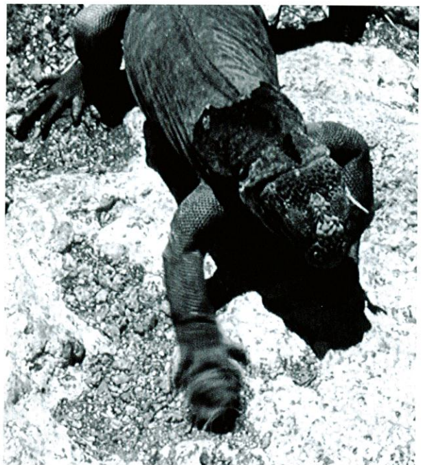
Galapagos land iguana rolling a cactus fruit on a flat rock to remove the spines.

Like all large iguanas, the land iguana's diet is primarily vegetable matter. More than fifty different plants are found in this iguana's diet. Favorite food items vary with the available vegetation from island to island. Among the plants eaten are Opuntia cactus , Scalesia (the tree sunflower), Ipomea (the morning glory), Sonchus (the sow thistle), and various sedges and grasses. Land iguanas have also been seen in trees eating