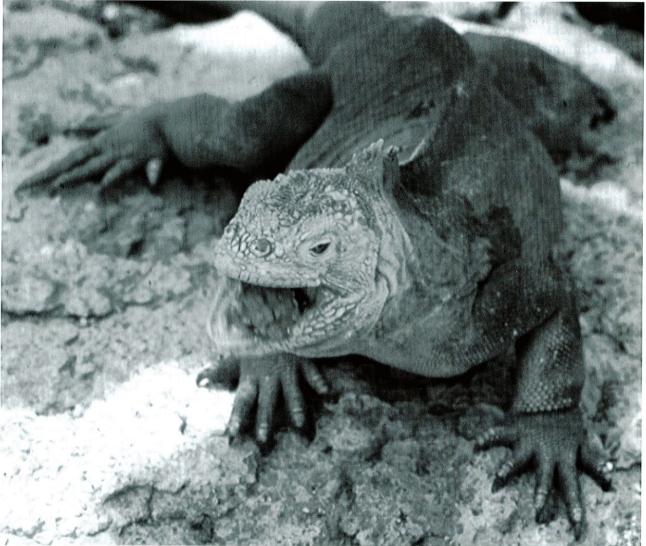
Galapagos land iguana eating cactus fruit after removal of spines.

the berries of the palo santo, bursera, and the muyuyu, cordia. If animal matter is easily available, the land iguana will eat it. Caterpillars and grasshoppers are commonly eaten. Young land iguanas will jump into the air to catch grasshoppers on the wing. Females have been reported eating dry fecal matter which suggests the recycling of incompletely digested material. Ingested along with green vegetation is a sizable amount of dirt, presumably a source of minerals and a supply of cellulose digesting enzymes for the lizards.