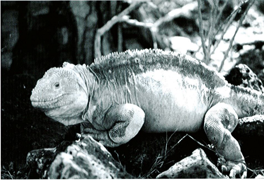
Galapagos land iguana, Conolophus pallidus. Of the two species recognized, this one is confined to Santa Fe Island.