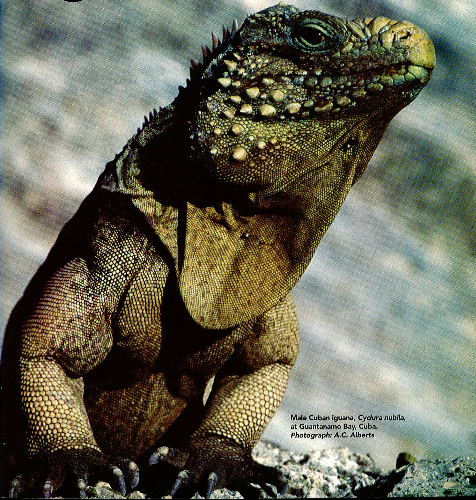
Male Cuban iguana, Cyclura nubila , at Guantanamo Bay, Cuba.