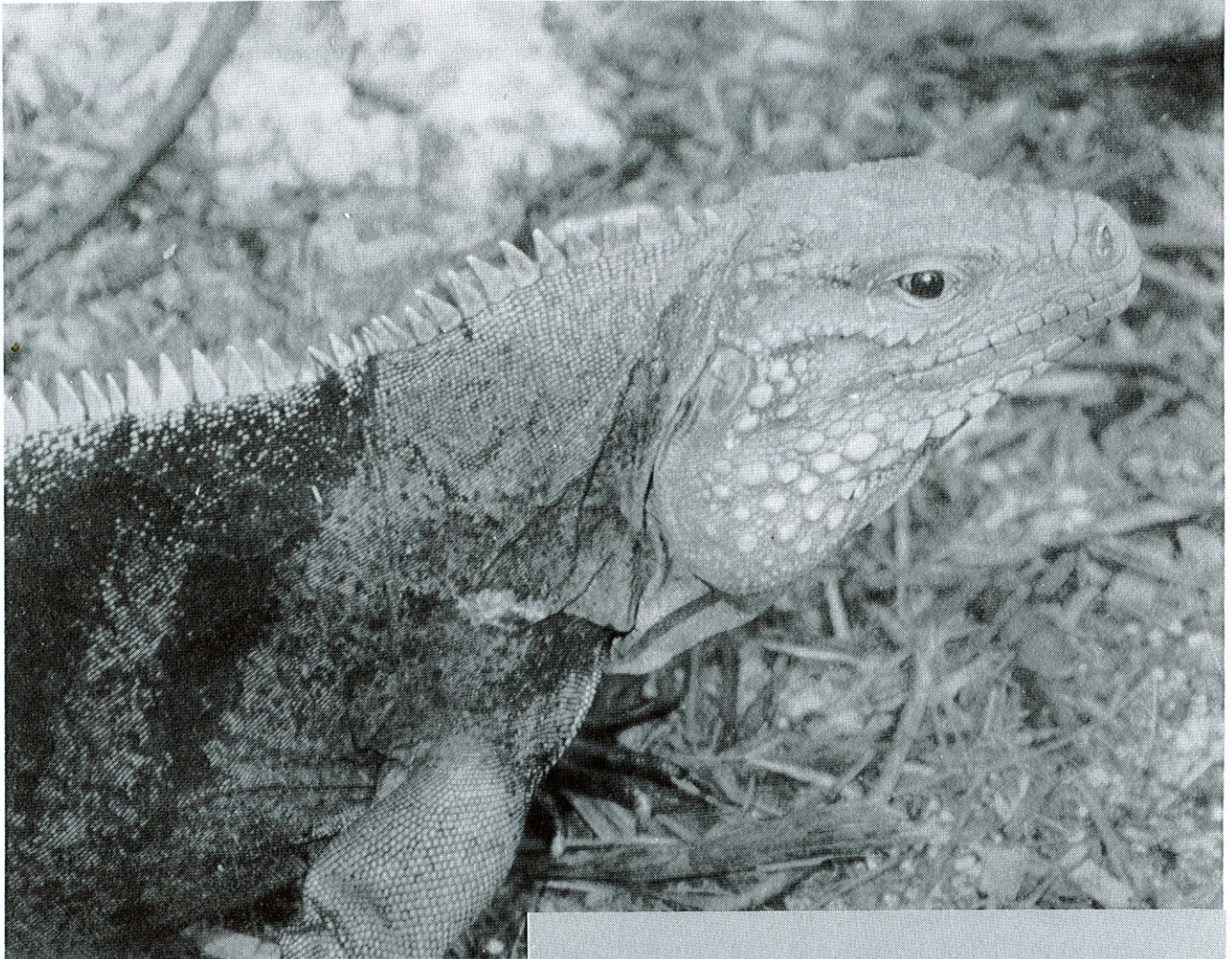
Hybrid Cayman Iguana, male Cyclura nubila lewisi x caymanensis .