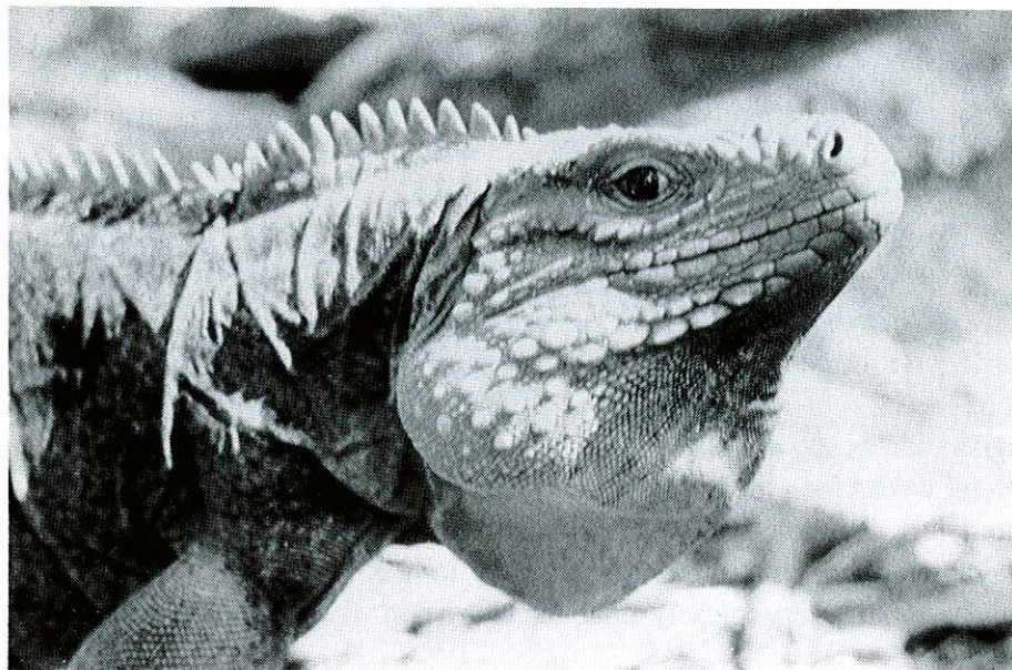
Cyclura nubila lewisi x caymanensis.