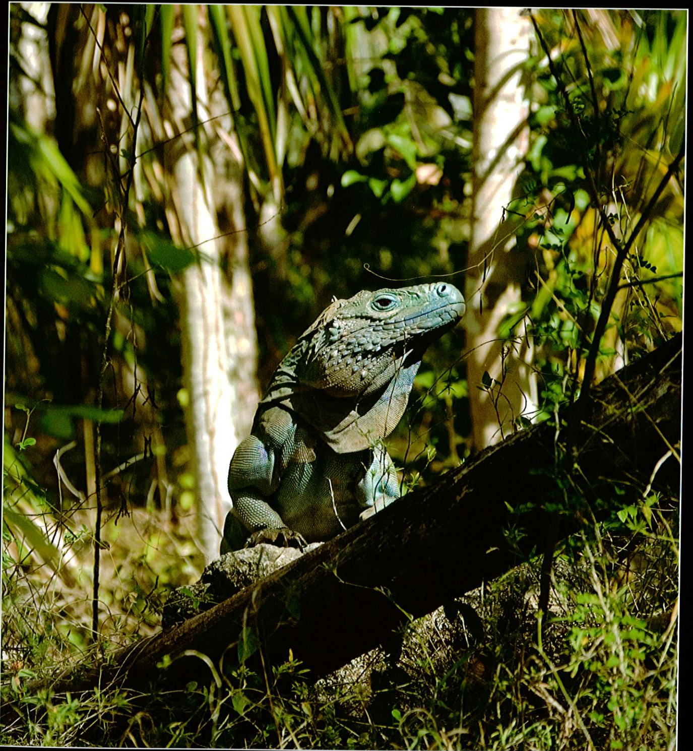
Grand Cayman Blue Iguana, Cyclura lewisi , Grand Cayman, Cayman Islands (see story p. 148).