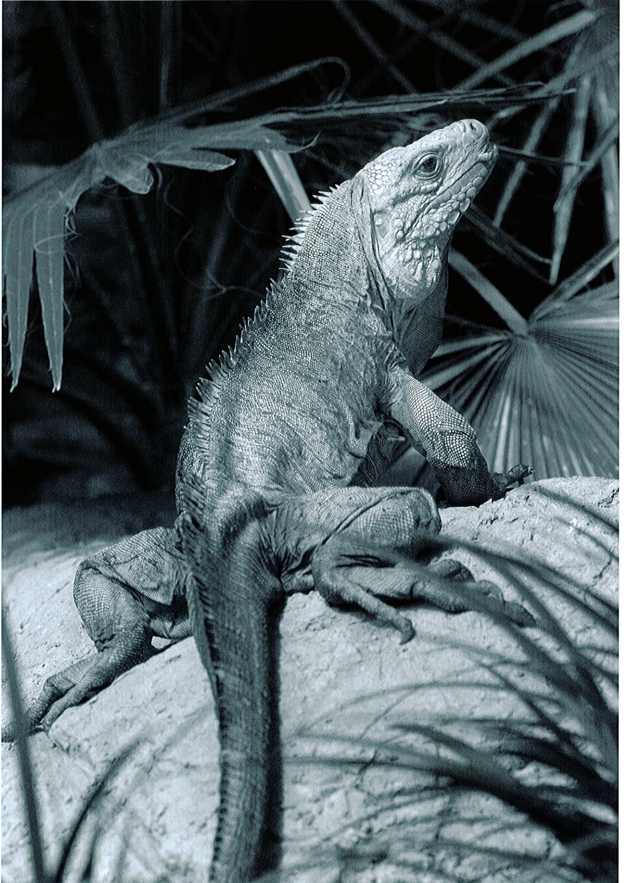
Grand Cayman Blue Iguana "Godzilla" (~1934–2004).