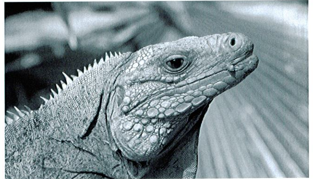
Godzilla's species name changed three times during his estimated 69 years of life. He was captured as Cyclura macleayi lewisi , later became Cyclura nubila lewisi , and passed away as Cyclura lewisi . This photograph shows his distinct telltale “moustache.”