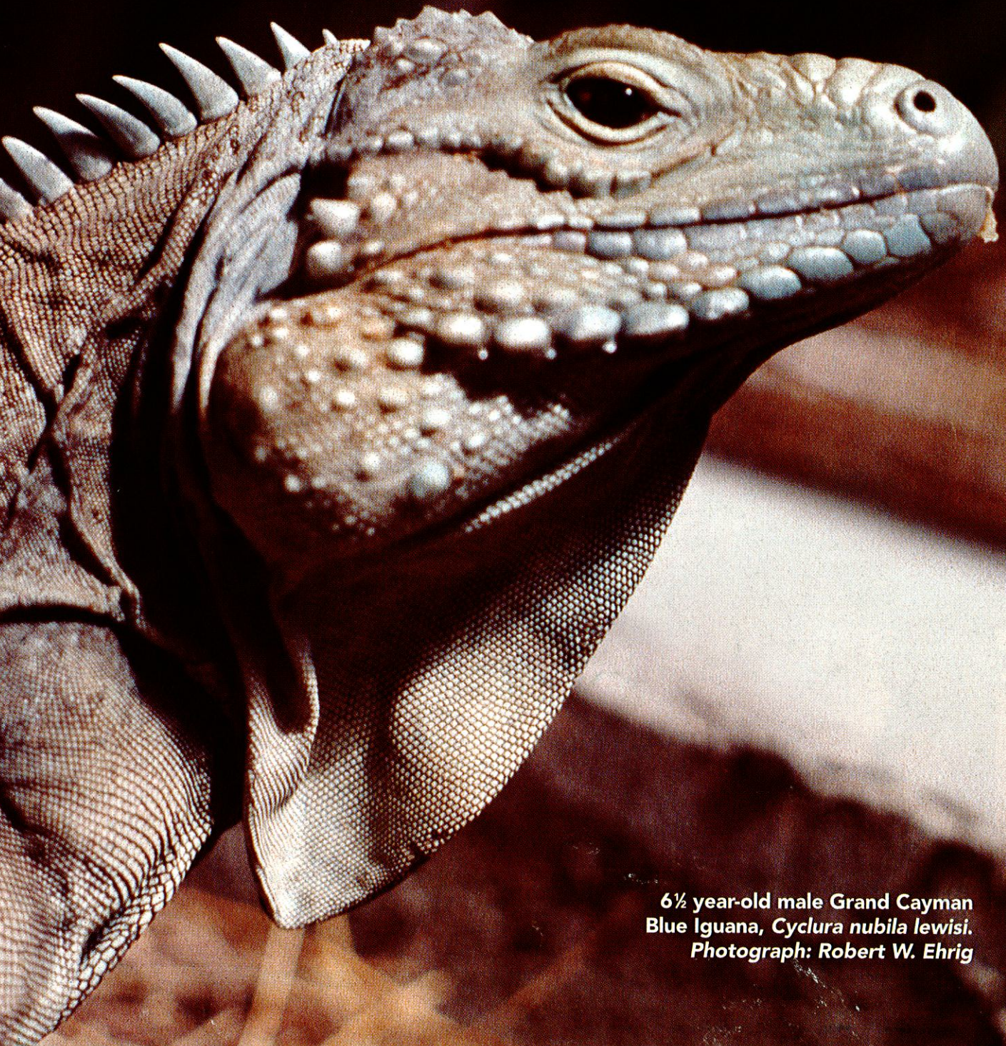
6½ year-old male Grand Cayman Blue Iguana, Cyclura nubila lewisi .