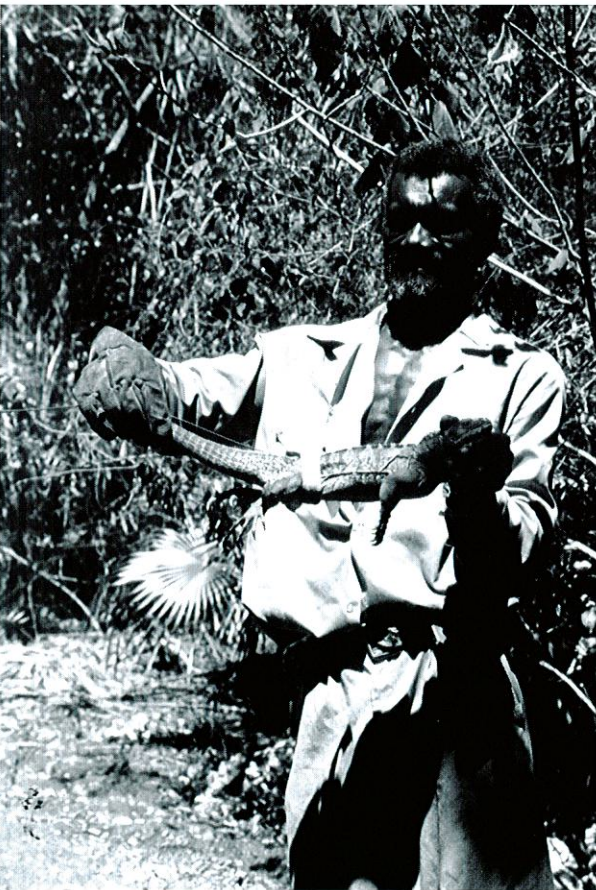
At a nesting site with tagged female collei .