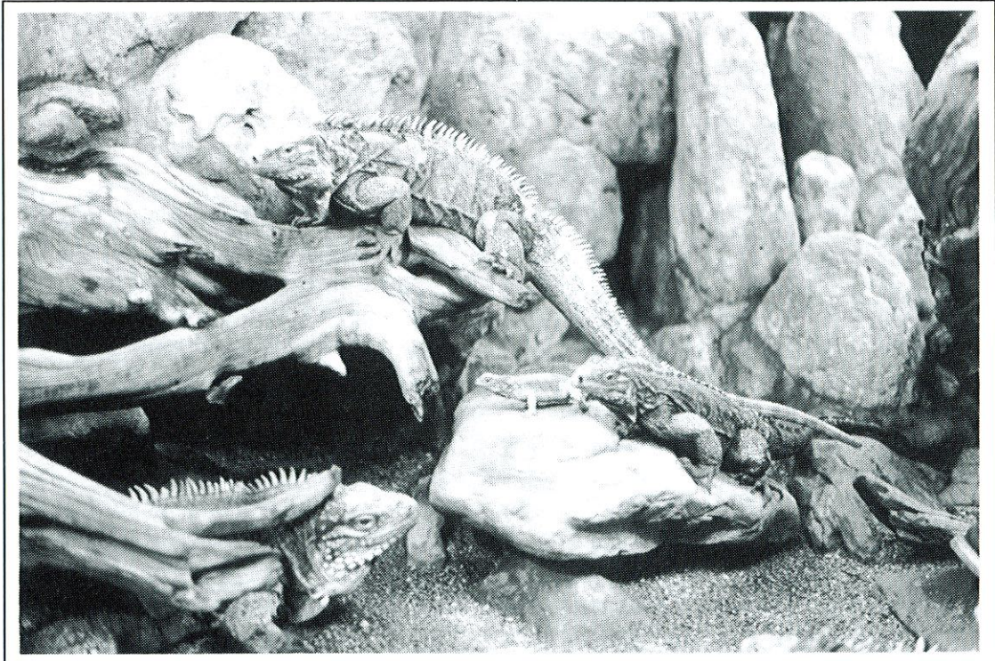
Captive exhibit at zoo, Cyclura nubila nubila.