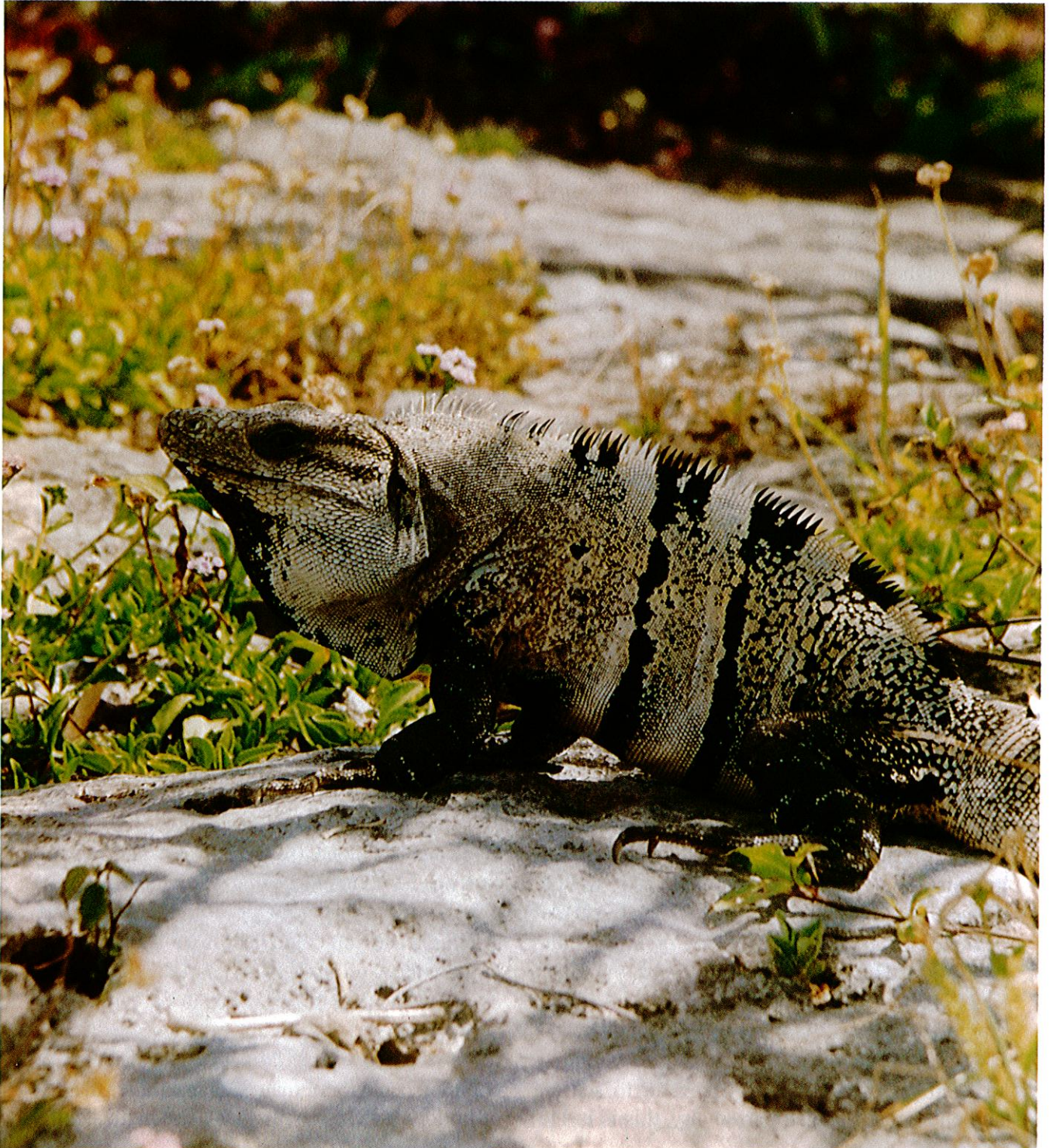
Adult male, Spiny-tail Iguana, Ctenosaura similis in Yucatan, Mexico.