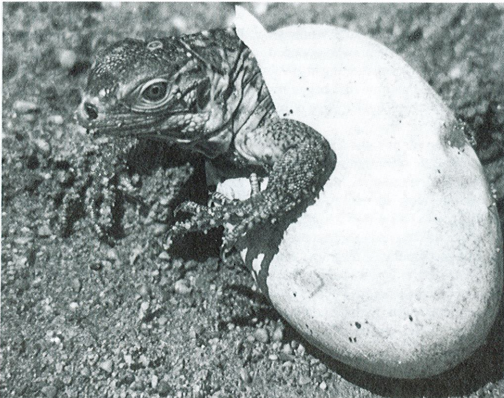
Hatchling Cuban iguana, Cyclura nubila nubila.

We apparently had done okay with our new exhibit, because we received two clutches of eggs and successfully hatched Cuban ground iguanas. The interesting thing about this is that this occurred in an indoor enclosure. To our knowledge, that was the first indoor reproduction of a Cyclura species. We continued to work with this species for the next several years, trying to perfect indoor management of them. We had some