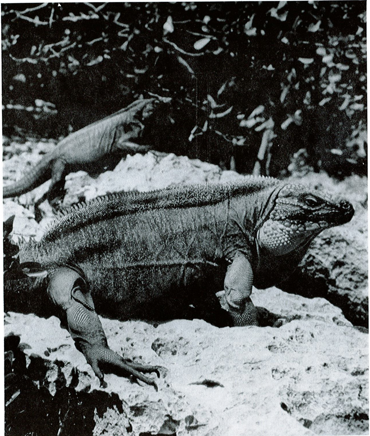
Allan's Cay Iguana on U-Cay, male and female.