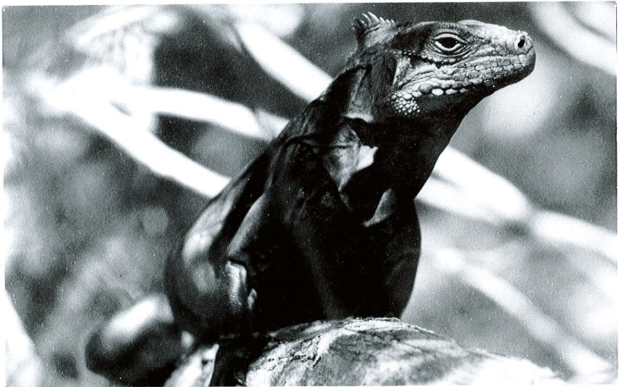
The Acklins Island rock iguana, Cyclura rileyi nuchalis, female in a tree.