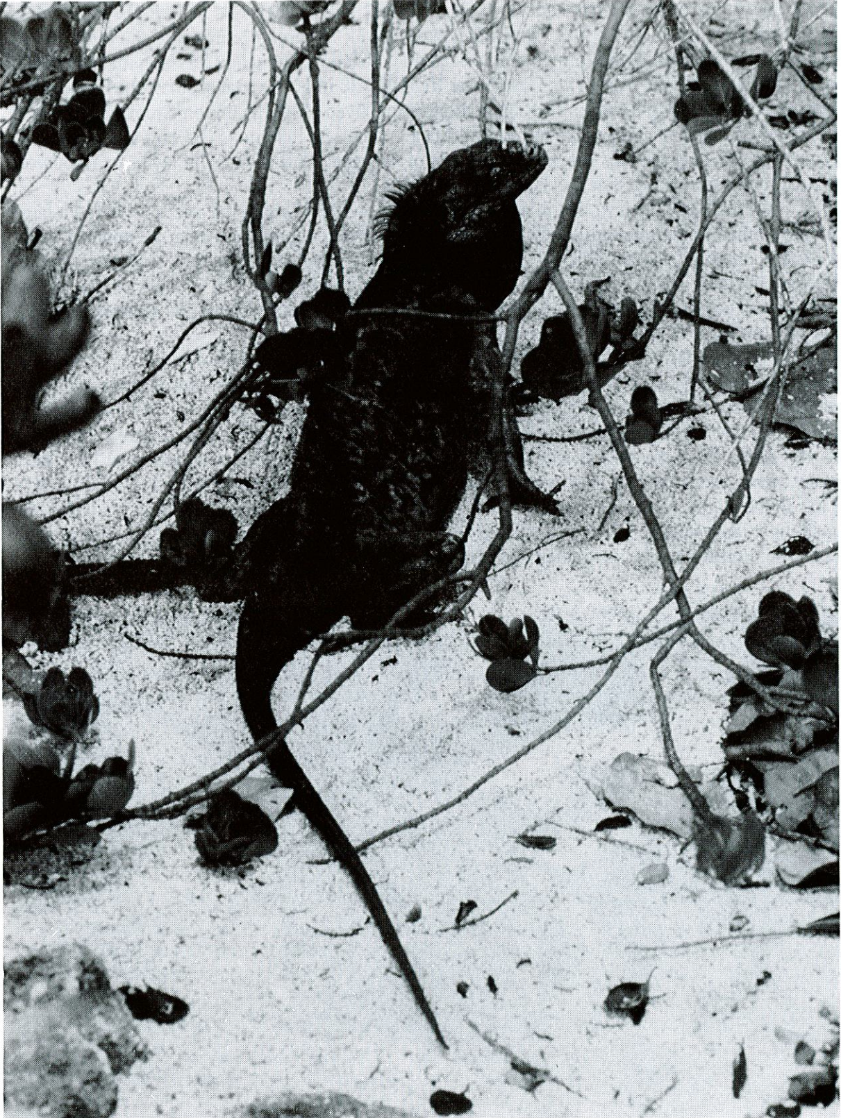
The Acklins Island rock iguana, Cyclura rileyi nuchalis , male on Fish Cay, or Guana Cay, as it is locally referred to.